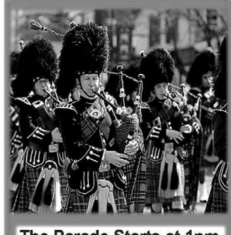
The Parade Starts at 1pm